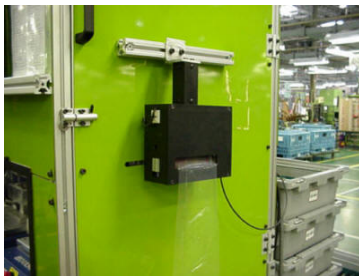
PAT Film Winder mounted to the outside of an assembly unit