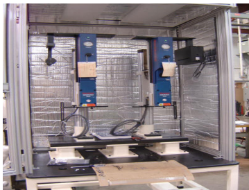
PAT Film Winder split to work on two machines